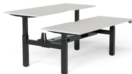
Back to Back Desk Frame with Cable Tray