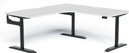
With Arms and Screen Brackets w/o Cable Tray