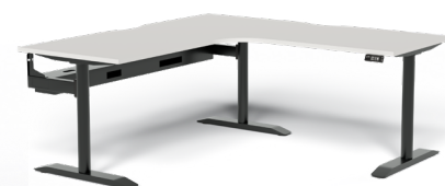
With Cable Tray and Screen Brackets