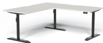
Without Cable Tray