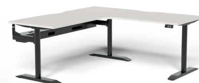
With Cable Tray and Screen Brackets