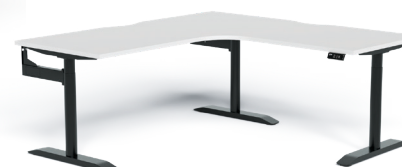
With Arms and Screen Brackets w/o Cable Tray