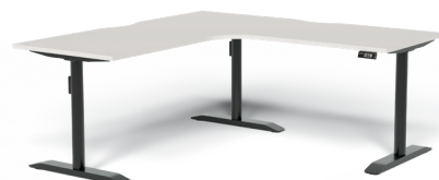
Without Cable Tray