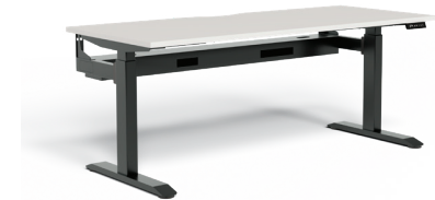
With Cable Tray and Screen Brackets