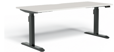
Without Cable Tray