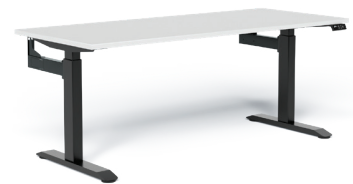
With Arms and Screen Brackets w/o Cable Tray